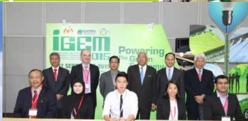
IGEM 2015 Participation Contract Signing

TNB Booth, Hall 4 (Ground Floor), Kuala Lumpur Convention Centre Open to Professionals & Trade Visitors Only