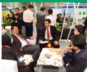
Exhibitor's Reception at the TNB Booth