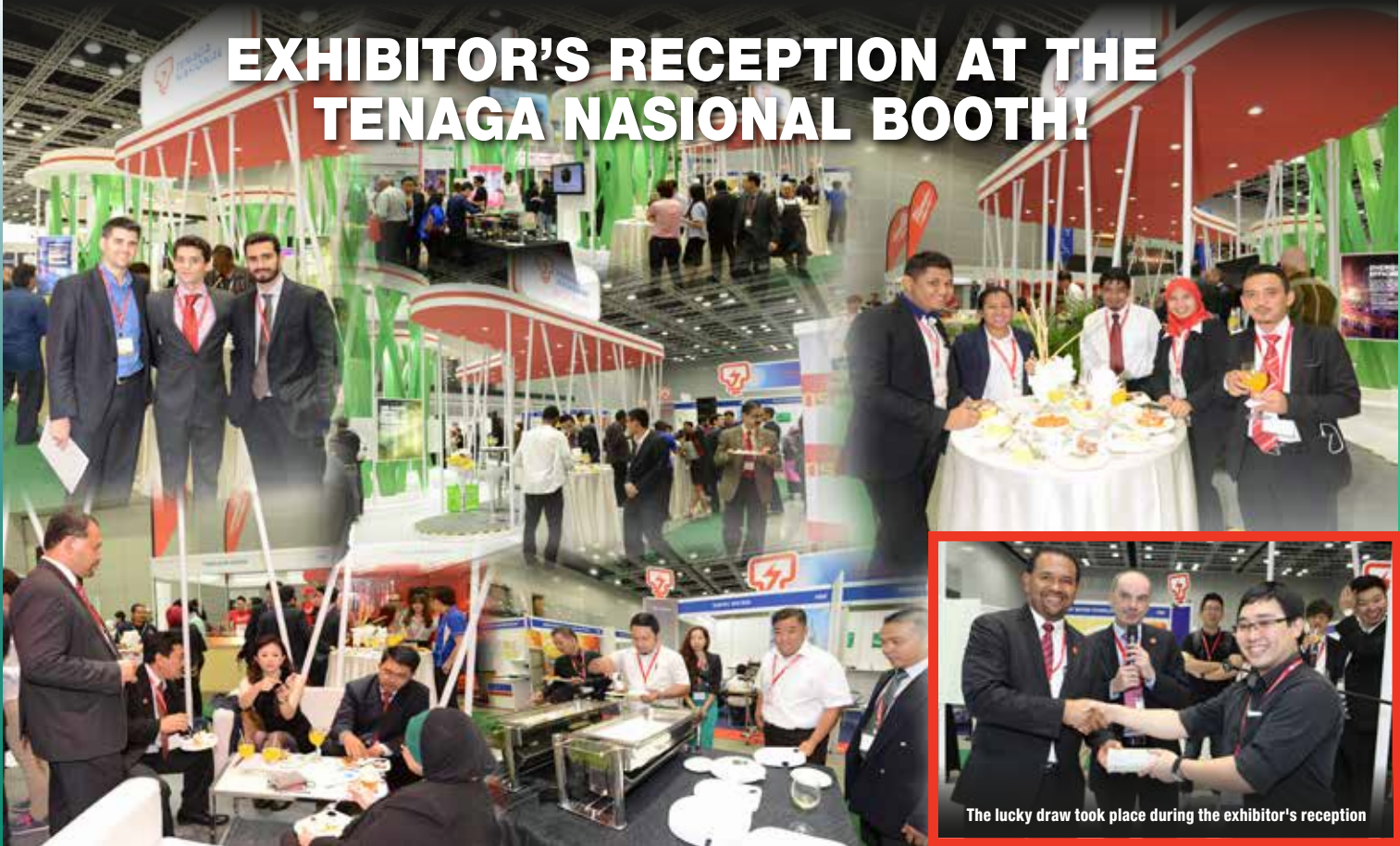
The lucky draw took place during the exhibitor's reception

TENAGA NASIONAL BERHAD (TNB), MALAYSIA'S PREMIER ELECTRICITY PROVIDER IS PROUD TO BE THE HOST OF THE ELECTRIC, POWER & RENEWABLE ENERGY MALAYSIA 2015 ON THE 25TH TO 27TH OF MARCH 2015 IN KUALA LUMPUR CONVENTION CENTRE.